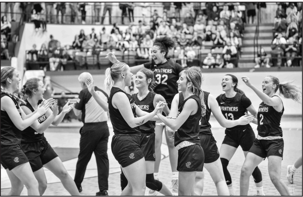
Union County celebrates its BOTS championship on Monday, Dec. 30.