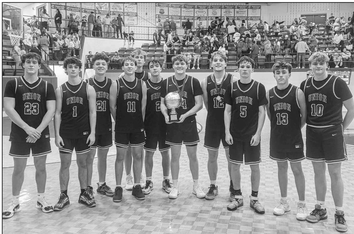
The Union County men's five BOTS titles (2000, 2006, 2010, 2023, 2024) is two more than the next closest team.

Young, Kaden Combs and Holden Payne made it 74-59 at the 2:55 mark, then Hughes all but secured Union's fifth BOTS title with a trey that